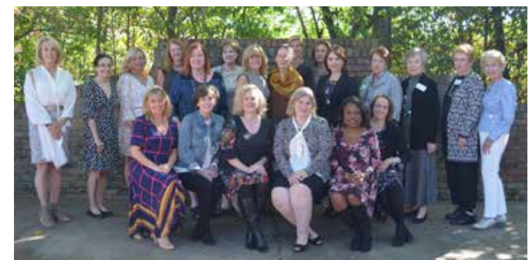
Past President's Luncheon

The Sustainers of the Junior League of Jackson are continuing to make an impact on Jackson's community, each other and the Junior League. Their compassion and loyalty makes a huge difference in the lives of the patients and families we serve.