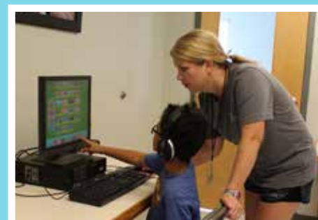
Arts in Motion

Through increasing the membership's awareness of differences within the community and offering ways to productively meet the needs of a wide variety of individuals, the cultural competency guidelines provide an essential resource for developing effective volunteers.