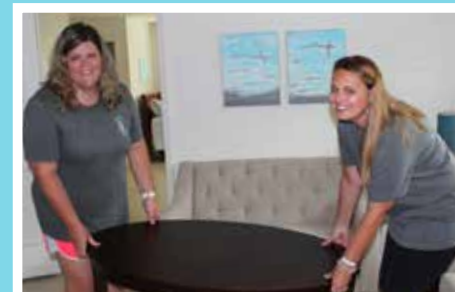
Sunshine for Sunnybrook