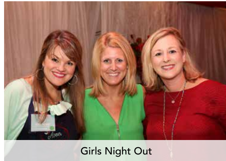
Girls Night Out