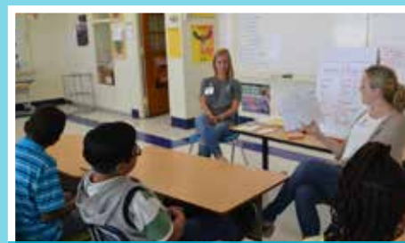
Wholesome and Healthy