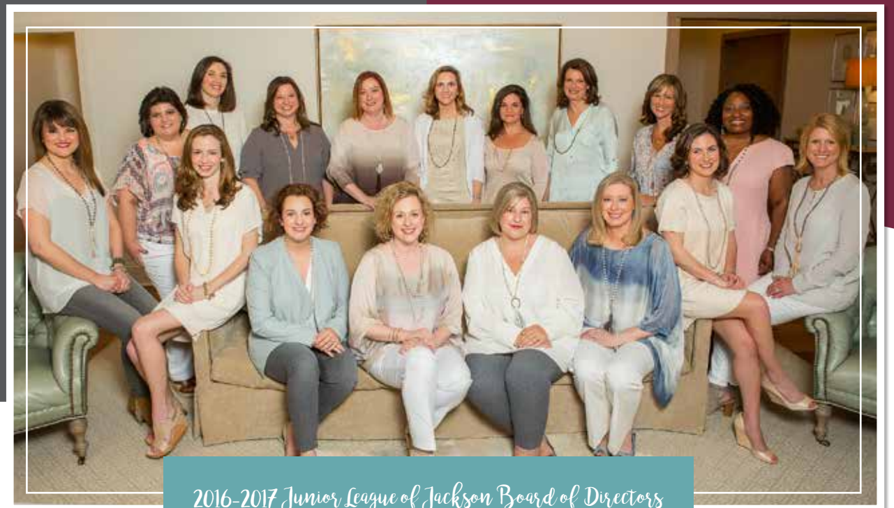
2016-2017 Junior League of Jackson Board of Directors