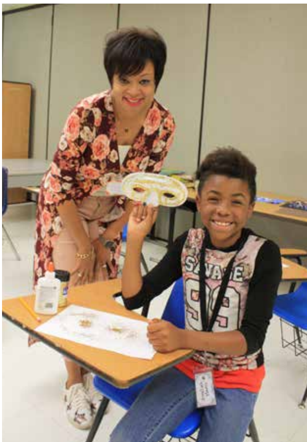
A student creates his "superhero mask" at the 2018 JPS Summer Camp.

Our programs impact early literacy, children's health, and the social development of children and youth.