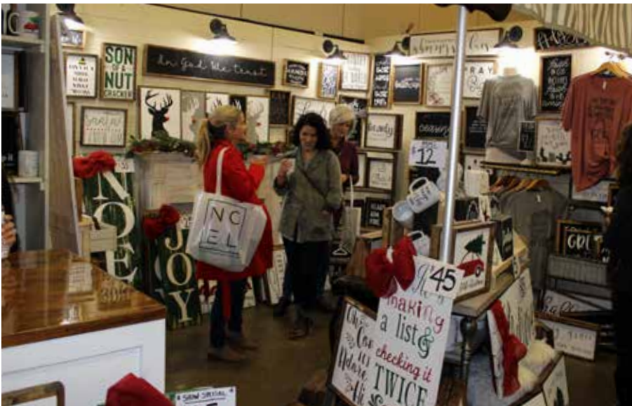
Above: Shoppers enjoy the convenience of a complementary shopping bag to help carry purchases. This year, 152 merchants from 20 different states offered unique and often exclusive products during the four days of Mistletoe Marketplace 2018. Right: A JLL volunteer pushes a beverage cart full of Coca-Cola beverages, presented by Clark Beverage Group, so that Mistletoe Marketplace shoppers can have refreshments while they shop.

Mistletoe Marketplace 2018 was held November 7-10 at the Mississippi Trade Mart in Jackson. This year, we sold over 20,000 general admission and special event tickets, and we estimate that more than 30,000 people attended. We should have final numbers in early 2019.